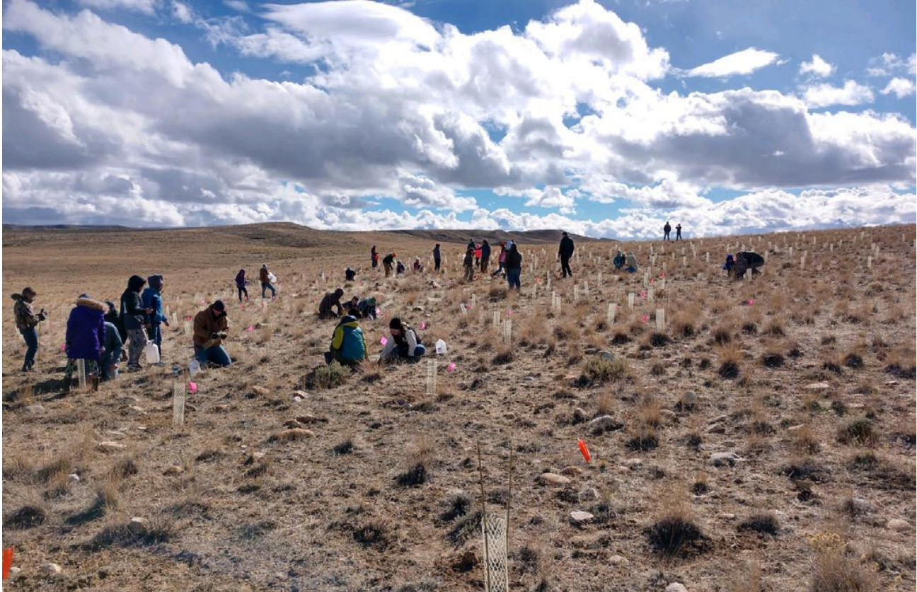
Students join the Wyoming Department of Environmental Quality, BLM, and OSMRE to plant sagebrush seedlings as part of the AML Native Plants Project.