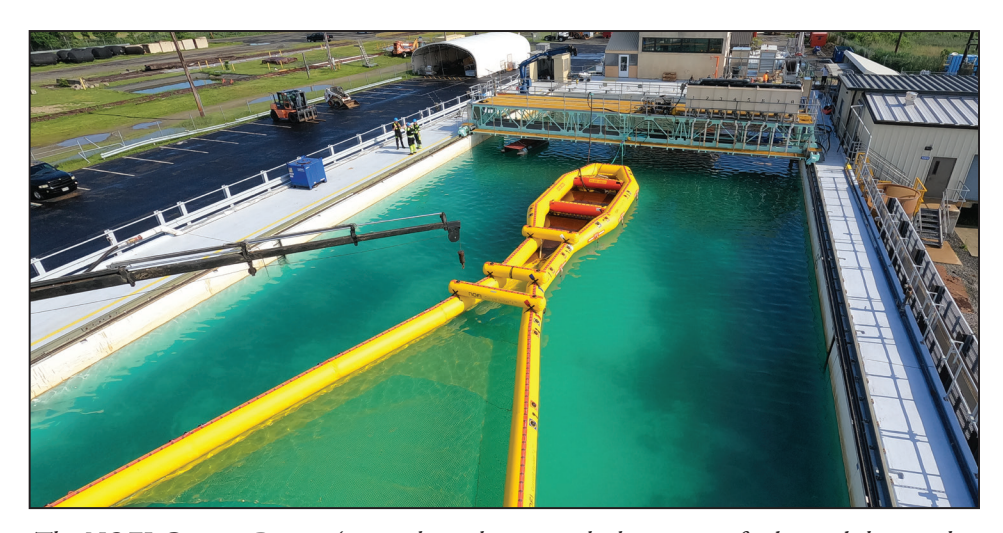
The NOFI Current Buster 4 runs through tests with three types of oil to validate and varify its ability to collect oil at 4.4 knots with and without waves.

The upgraded Current Buster 4 was tested at sea without oil under the observation of DNV, an international accredited registrar and classification society. These tests indicated the system could collect oil at a maximum speed of 4.4 knots. To verify the system is able to collect different types of oil that speed and in waves, NOFI, along with AllMaritim AS and QualiTech Environmental Inc. conducted