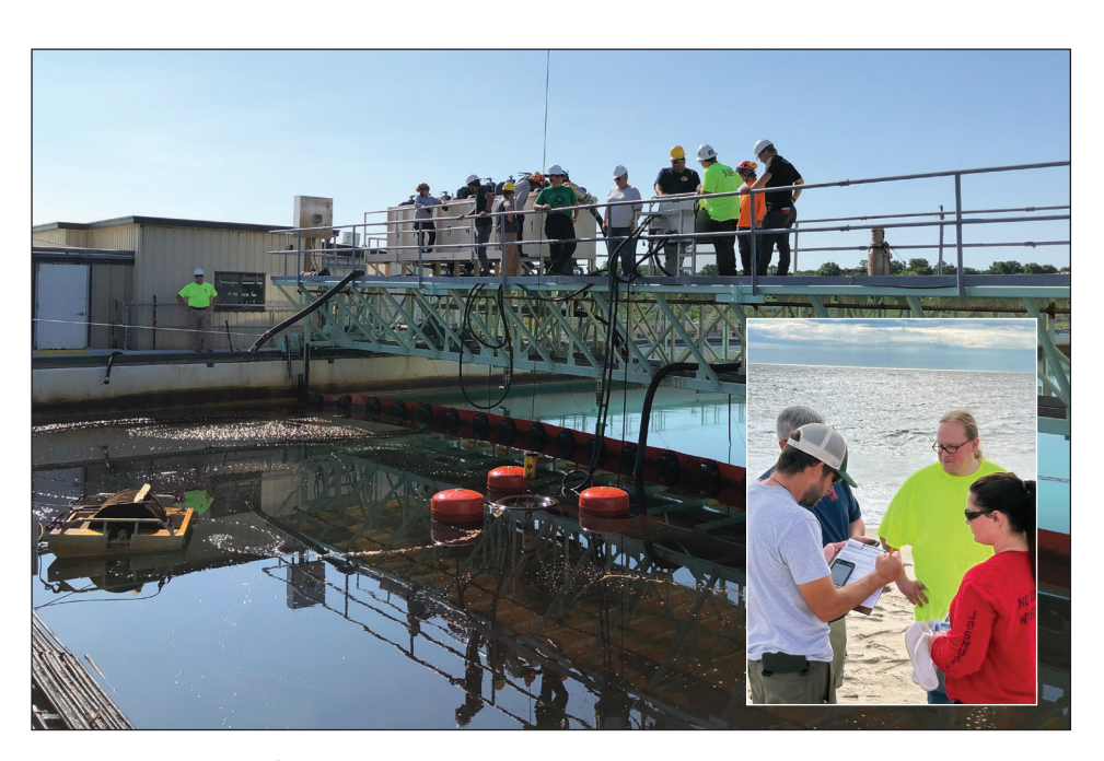
During the Texas A&M Unviersity National Spill Control School Oil Spill Strategies & Tactics training session, attendees practiced hands-on skimming operations in the Ohmsett tank, as well as SCAT training at a local beach.

The participants then went out to the Ohmsett test basin where they observed oil behavior, containment strategies, and recovery demonstrations using various skimmers. The hands-on tank exercises provided them with the opportunity to take turns operating a skimmer to collect real oil from the test basin. As a bonus, Ohmsett staff conducted a dispersant demonstration where the participants could see first-