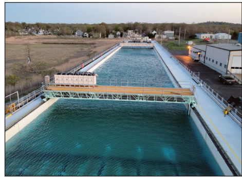
The Ohmsett tank was drained in July 2021 for scheduled maintenance. After extensive concrete repair, new seals and viewing windows, and a new epoxy coating, the tank was refilled and ready for customers in May 2022.

draining, a considerable amount of monitoring took place to make sure the in-line filter system could keep up with the high flow rate, all while maintaining the needed water quality," said Tom Coolbaugh, Ohmsett program/facility manager.